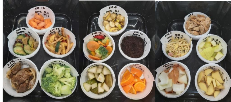
Figure 1 Pictures of some of the individual food items after cutting

Based on the dry matter percentages and proportions of all products in the mix, the average dry matter percentage of the mix was 28 %. At t=0 days (start of the trial) and t=28 days fresh food items were purchased.