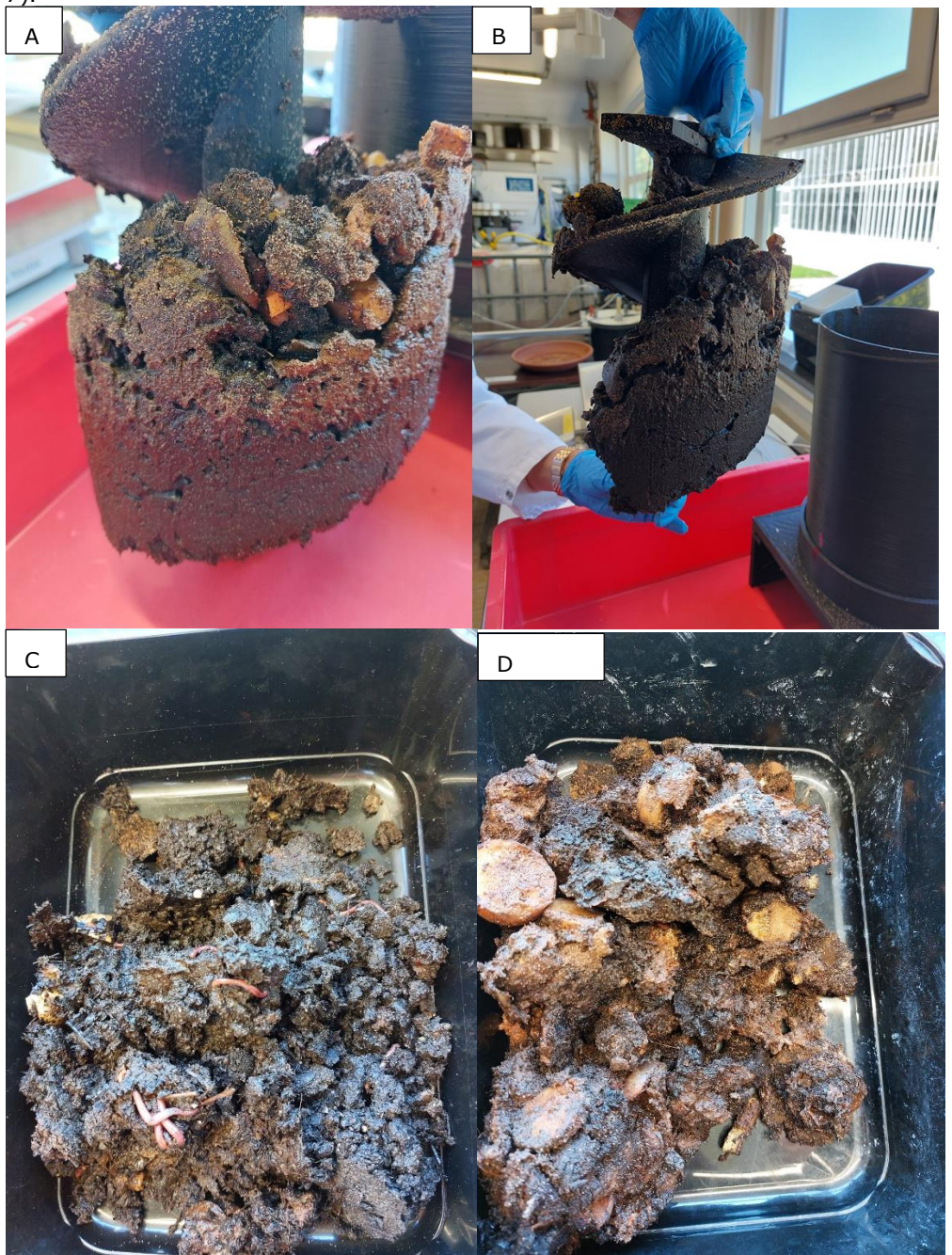
Figure 7 Pictures of the composter content at the end, with a visible two layered composition. A) layers in the composter, B) layers in the composter, C) bottom layer with worms, D) top layer with mainly undigested food waste

At the end of the test two distinct layers were visible: the top layer appeared to be non-digested food waste, while the bottom layer appeared to be digested food waste, with worm tunnels visible (Figure 7).