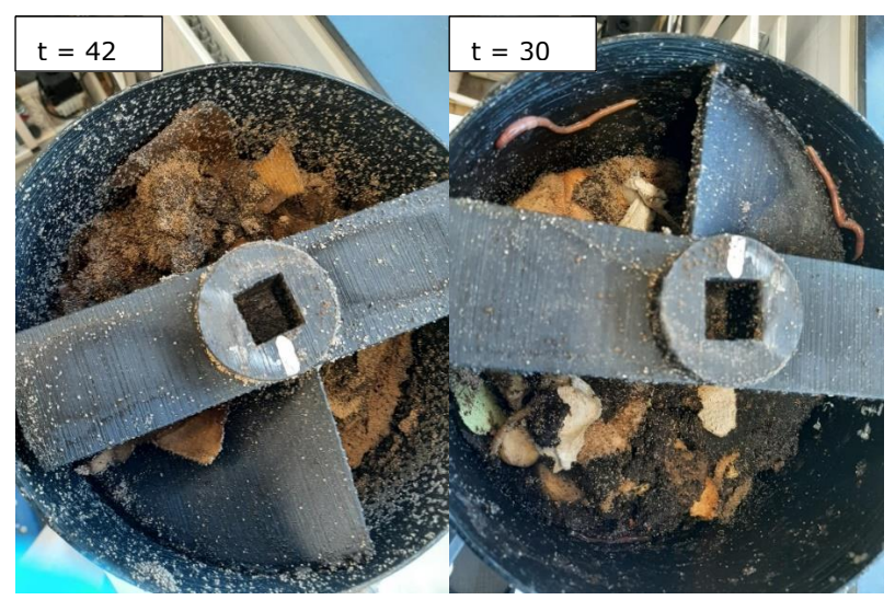
Figure 5 Top views of the composter at different times during the test.

Worm faeces (dark coloured) were initially visible on the walls of the composter. Towards the end of the test, an increasing amount of mites was growing in the composter (Figures 5 and 6). They were mainly located on the food waste surface and the visible upper composter components. As well as in the first test, pot worms (Enchytraeidae) were also found in the composter. Both species originated from the worm stock and bedding material that came with it