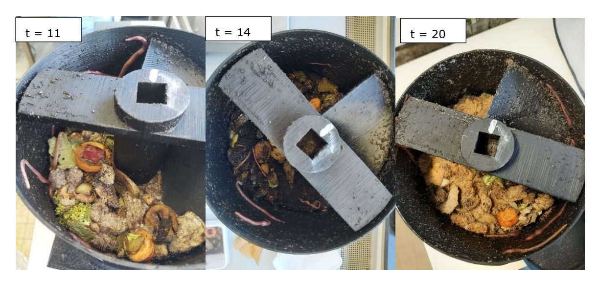
Figure 5 shows top views of the composter during the test after lid removal