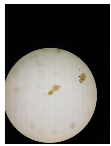
Figure 6 Close-up of mites (species were not identified) from the composter

Worm faeces (dark coloured) were initially visible on the walls of the composter. Towards the end of the test, an increasing amount of mites was growing in the composter (Figures 5 and 6). They were mainly located on the food waste surface and the visible upper composter components. As well as in the first test, pot worms (Enchytraeidae) were also found in the composter. Both species originated from the worm stock and bedding material that came with it