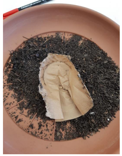
Figure 4 Fallen out brown paper and start soil/ worm compost at t= 13

The screw was not removed from its surrounding tube, and material was added through the tube aperture at the top of the composter. This was repeated during the test when adding food waste. The bottom of composter contained a hole, which was designed for worm compost to fall out. This hole was at first covered with a thin layer of brown paper, to prevent spillage of worms at the start. Worms that fell out during the test (after 13 days the brown paper had fallen out, Figure 4), were placed back in the composter. Spilled worm compost/start soil/food waste that fell out during the test was weight and discarded.