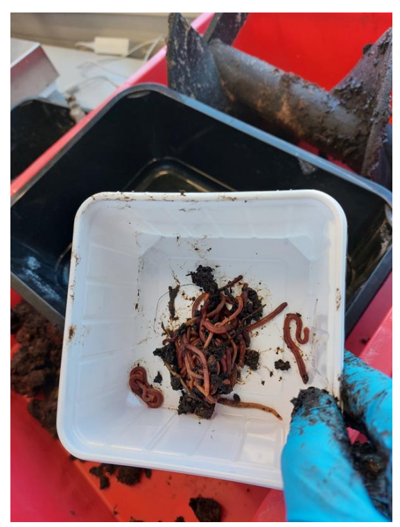
Figure 8 Worms found in the bottom layer of the composter at t=50