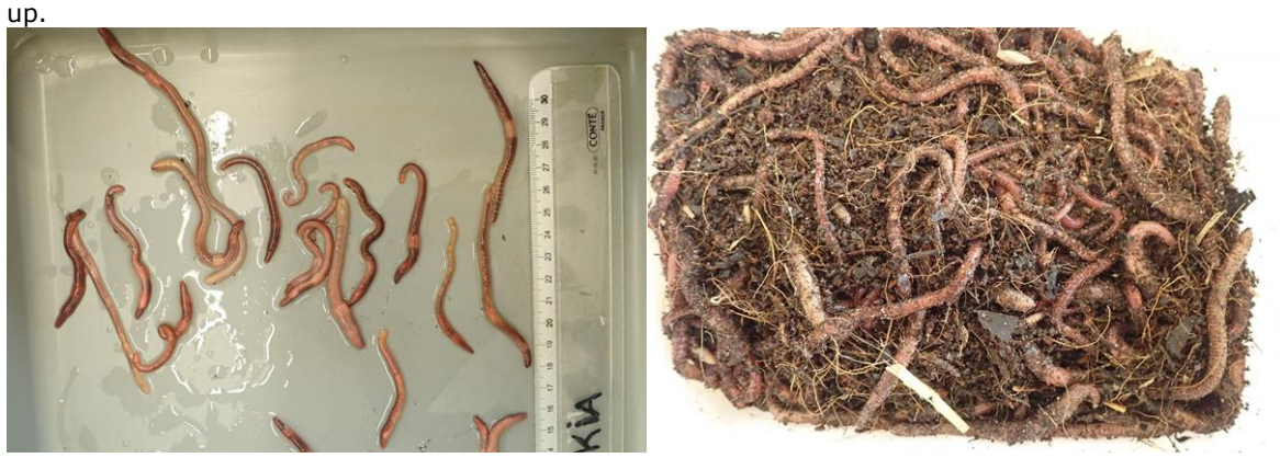
Figure 2 Worm sizes at the start (left) and in the transport material (right)

Worms (Figure 2) were a mix of Eisenia fetida and Dendrobaena veneta in a ratio of ~8:2 and had been purchased from WormsSystems (Oostwold, the Netherlands). Worm soil/compost was also obtained from the same supplier and used for creating a bottom layer in the composter at the start-